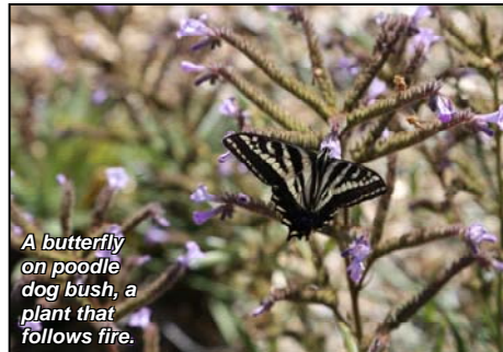
A butterfly on poodle dog bush, a plant that follows fire.

The first 1.5 miles or so were shaded by a variety of tree cover, and we all enjoyed the respite from the heat. Although we didn't have heat to contend with at that point, we had bugs! Gnats and flies, oh my!