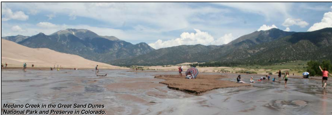
Medano Creek in the Great Sand Dunes National Park and Preserve in Colorado.