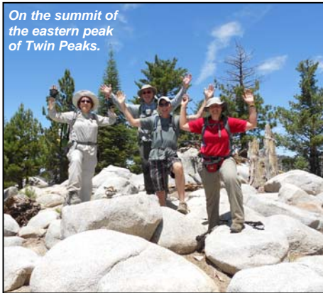
On the summit of the eastern peak of Twin Peaks.

trail junction, where we turned left toward the saddle between Waterman and Twin Peaks. And continued dropping.