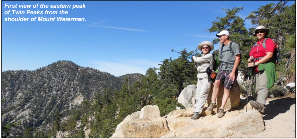
First view of the eastern peak of Twin Peaks from the shoulder of Mount Waterman.

We started at Buckhorn, familiar to most as the start point for most hikes up Waterman. At the familiar junction about two thirds of the way to the summit of Waterman, where we turn right to go to the summit, we turned left instead and went down the Waterman Trail toward Chilao. After dropping down long enough that we were already dreading the climb back up again on the return, we came to the another