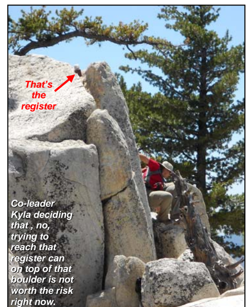
That's the register