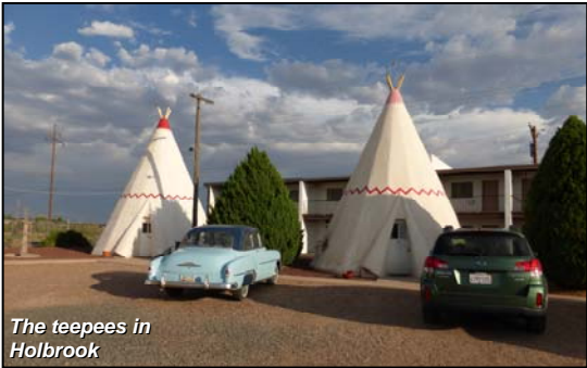
The teepees in Holbrook

they came through here in the 50s, on their way from Missouri to settle in southern California. The construction of Interstate 40 really impacted towns that were bypassed, and Holbrook was no exception. Even though parts of it seem like a ghost town, there still are many cool places in this former cowboy town that one can visit.