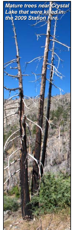
Mature trees near Crystal Lake that were killed in the 2009 Station Fire.

...while hiking, do not seek shelter in a gully or canyon. These can act like chimneys, creating a pathway for the fire to follow. Instead, seek a large lake or stream, or, if there is no water nearby, bare, stony ground, preferably on a ridge. Look for a bare spot and stay to the uphill side of it. Cover yourself with whatever clothing you have, or even a sleeping bag, and keep your pack on your back for extra protection unless you have stove fuel in it and have no time to get it out and toss it away. Keep your head covered; if you have time, wet a bandana or shirt and keep it over your nose and mouth. Lie on your stomach facing away from the fire, near the uphill side of the bare space, and cover your head and face as much as you can. With luck, the fire will jump the bare spot and you. Be prepared for intense heat and possibly some burns—the point is to survive.