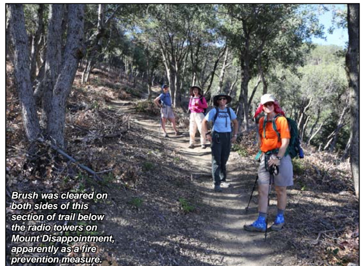
Brush was cleared on both sides of this section of trail below the radio towers on Mount Disappointment, apparently as a fire prevention measure.