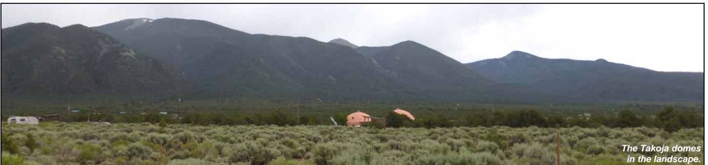
The Takoja domes in the landscape.