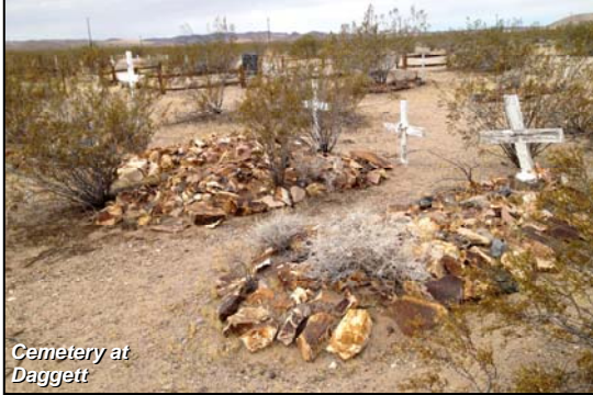
Cemetery at Daggert

For our first night, we stayed in the infamous teepees of the Wigwam Motel in Holbrook Arizona. This is a great stop if you want to take a moment to savor the historic past of Route 66. I couldn't help but wonder where my family stayed when