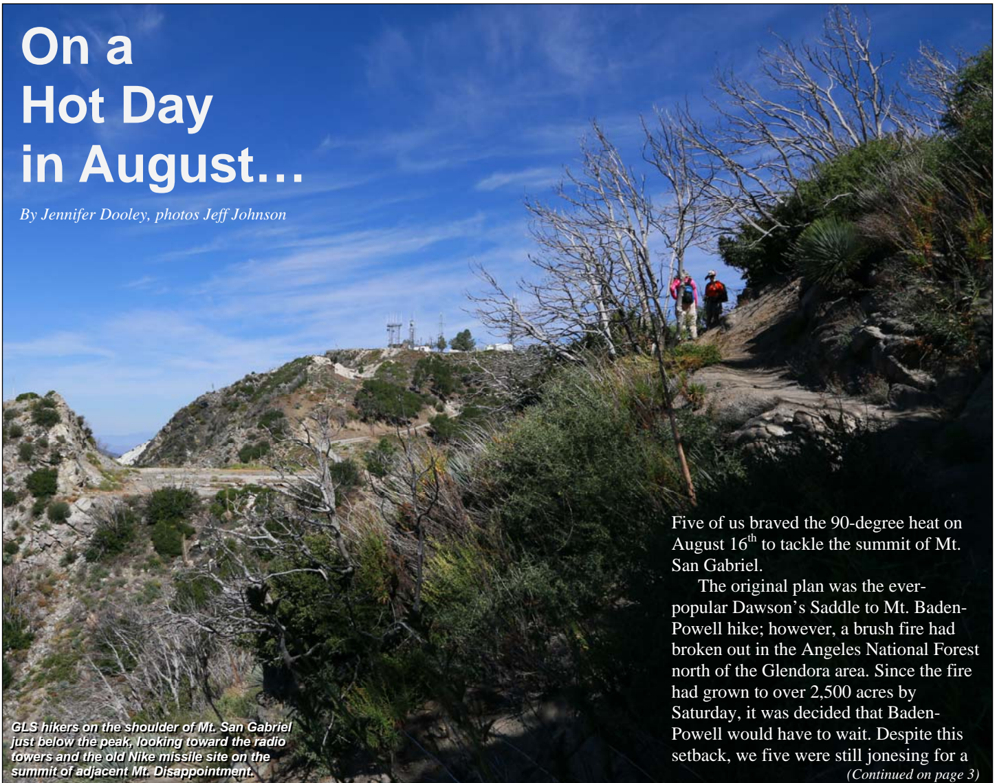
GLS hikers on the shoulder of Mt. San Gabriel just below the peak, looking toward the radio towers and the old Nike missile site on the summit of adjacent Mt. Disappointment.

Five of us braved the 90-degree heat on August 16 th to tackle the summit of Mt. San Gabriel.