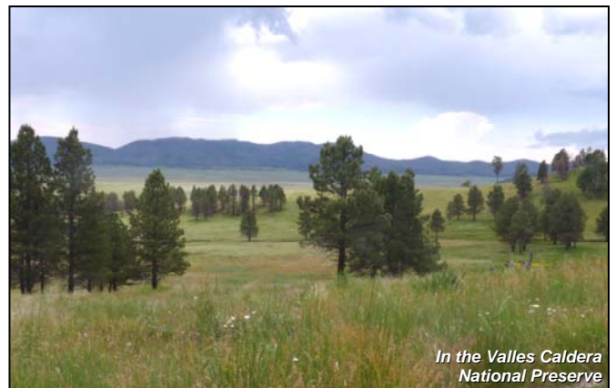
In the Valles Caldera National Preserve