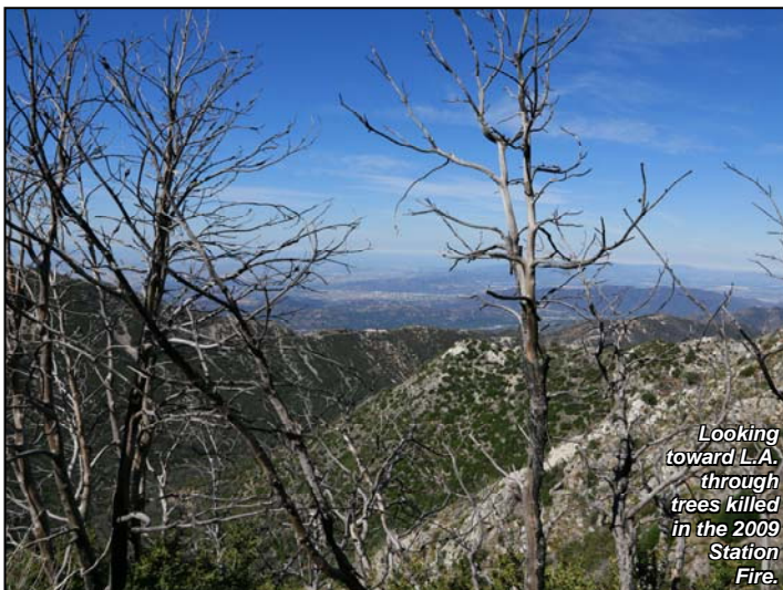
Looking toward L.A. through trees killed in the 2009 Station Fire.

Our Mt. San Gabriel outing turned out to be a great way to (almost) beat the heat.