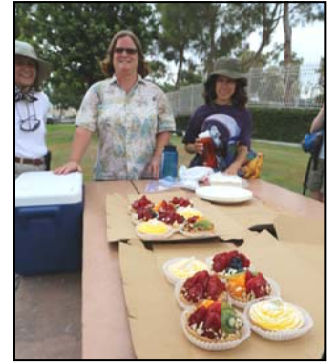
Below: A wall covered with grape vines by the L.A. river. Below right: Ducks in the wetlands expecting handouts. Above right: Birthday treats.

Now, here's the challenge for next year: will we be able to come up with a walking route that gets us to the settling basin on the west side of the river?