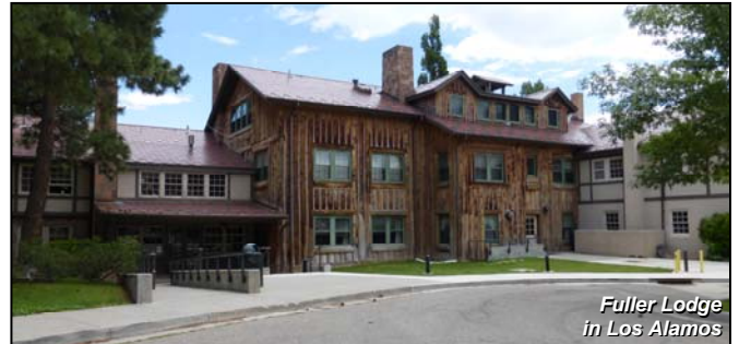
Fuller Lodge in Los Alamos