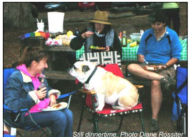
Still dinnertime.