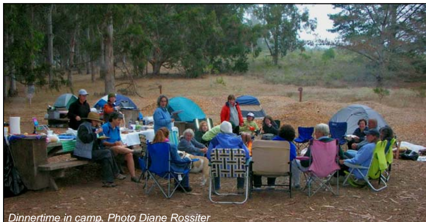
Dinnertime in camp.

Also a lot of good food -- and people. Home by dark.