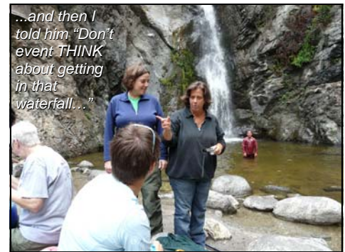
...and then I told him "Don't even THINK about getting in that waterfall..."