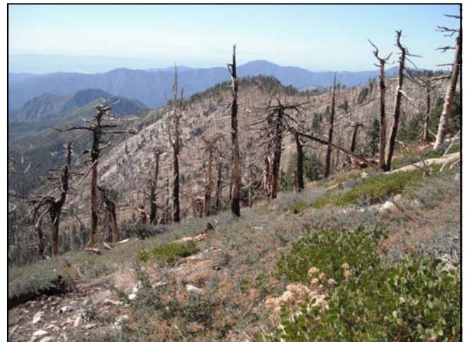
Left: In the roofless shelter hut below the summit of Mount Islip, a pleasant hike from Little Jimmy campground. Below, Islip Ridge, on the south side of Mount Islip summit, seen from the trail, still showing the effects of the Curve Fire that burned the area in 2002.

his adventures in the Navy, and with a large group of Boy Scout parents who were learning how to keep their kids safe on future wilderness trips. In spite of the presence of other folks, the night was peaceful, and we spent time searching for constellations and comets. Hopefully, there will be many more such backpacking opportunities, so if you haven't gone backpacking but really want to try it, keep an eye on this newsletter and come on out!