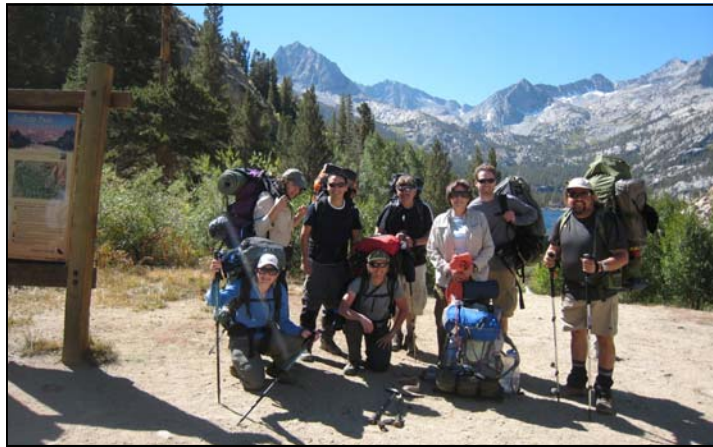
Left, starting the backpack at the South Lake trailhead, Above, the windblown hikers resting at Bishop Pass, Right, view over Long Lake from the campsite below Bishop Pass