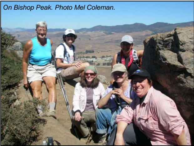
On Bishop Peak.