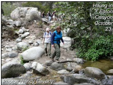
Hiking in Eaton Canyon, October 23.