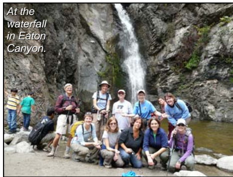
At the waterfall in Eaton Canyon.