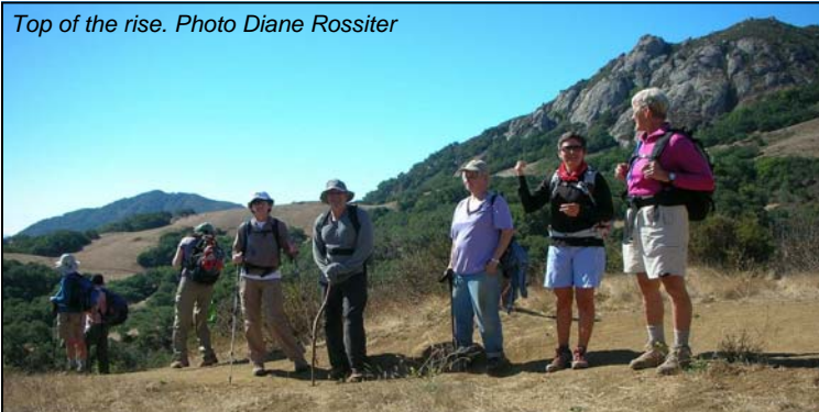
Top of the rise.

some more. This part of the trail ran the flank of the mountain and from this vantage point, we had sweeping views of the valley, beautiful views of some of the other Sisters that are part of this volcanic chain,