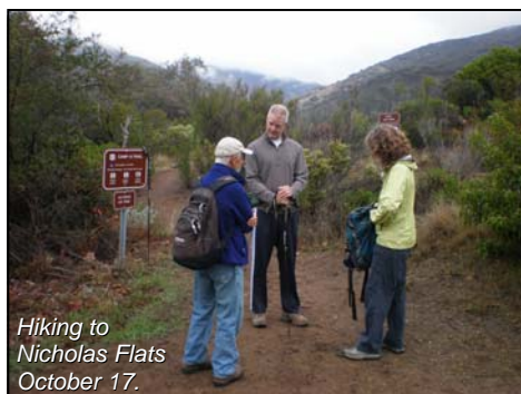
Hiking to Nicholas Flats, October 17.