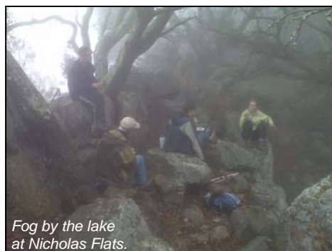
Fog by the lake at Nicholas Flats.