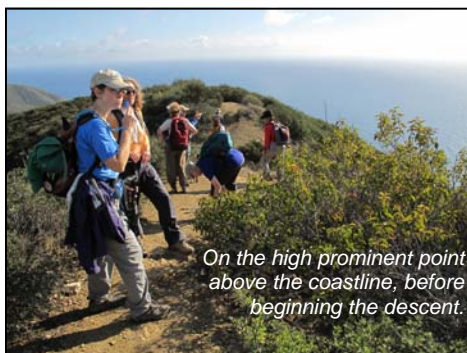
On the high prominent point above the coastline, before beginning the descent.

In the middle of what seemed like nowhere, there were a couple of picnic tables! Alan herded us in the general direction and we pulled out 'lunch'.