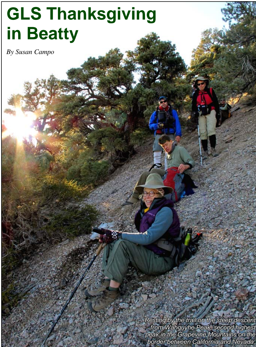
Resting by the trail on the steep descent from Wahguyhe Peak, second highest peak in the Grapevine Mountains on the border between California and Nevada.