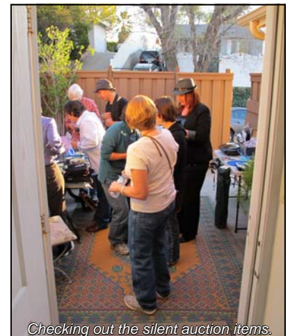
Checking out the silent auction items.