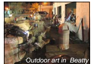
Outdoor art in Beatty