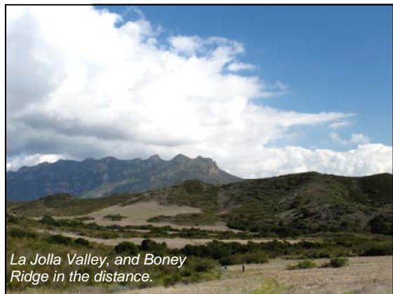
La Jolla Valley, and Boney Ridge in the distance.