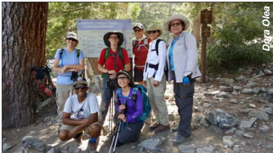
Above: July 30, at the Icehouse Canyon trailhead, starting toward Icehouse Saddle and Ontario Peak.