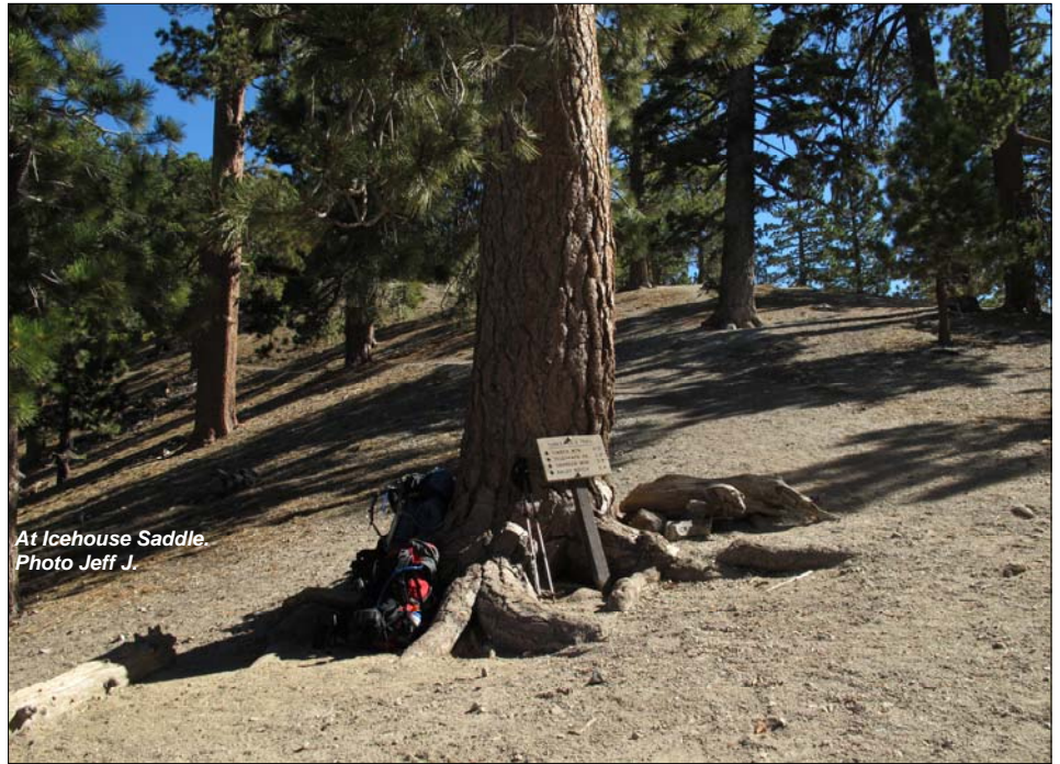
At Icehouse Saddle.