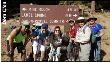
Above: July 24, Starting at the Vincent Gap trailhead toward Mt. Baden-Powell.