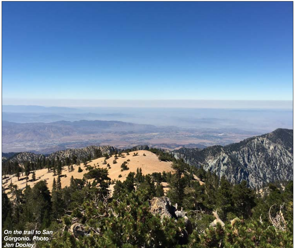
On the trail to San Gorgonio.

JOIN US TO WALK FROM 6 miles (to a much longer option) as we see all the pretty downtown decorations and count all decorated trees just for fun. Wear good walking shoes and bring money for lunch. Meet at 9 am sharp in front of the red line Metro entrance....out on the street at the corner of 7th and Figueroa St, LA.