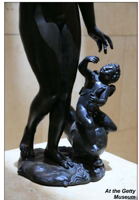
At the Getty Museum