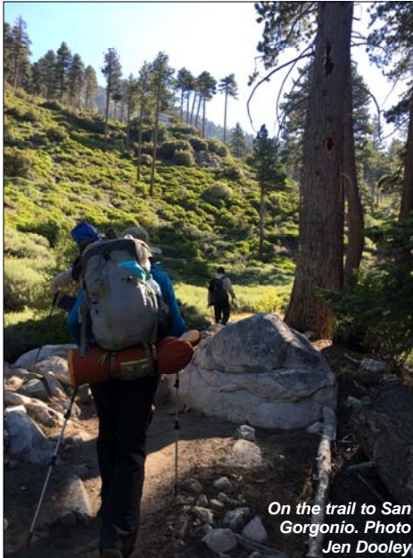
On the trail to San Gorgonio.

Join us for a hike up Mt. Lowe once known as "Railway to the Sky," Los Angeles' first funicular. Only a few foundations exist today! A moderate paced hike. We will pass a beautiful waterfall in the distance, nice trees and views of the