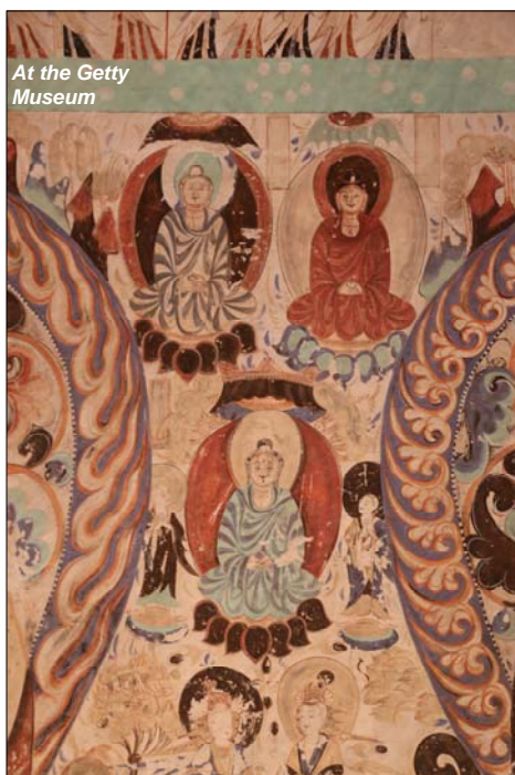
At the Getty Museum