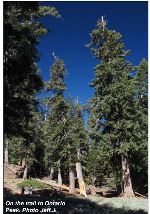
On the trail to Ontario Peak.