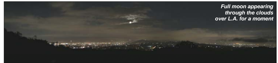
Full moon appearing through the clouds over L.A. for a moment