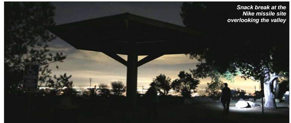
Snack break at the Nike missile site overlooking the valley

After dinner, the clouds had fun playing hide and seek with the moon during our return trip but giving us just enough light to find our way back to the cars.