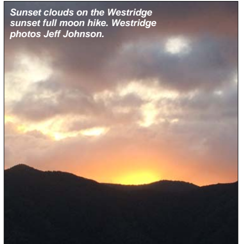
Sunset clouds on the Westridge sunset full moon hike.

And when the sun set, my goodness, the trail got mighty dark; unlike at Griffith Park on our Wednesday night hikes, there was no bounce from the city lights and I