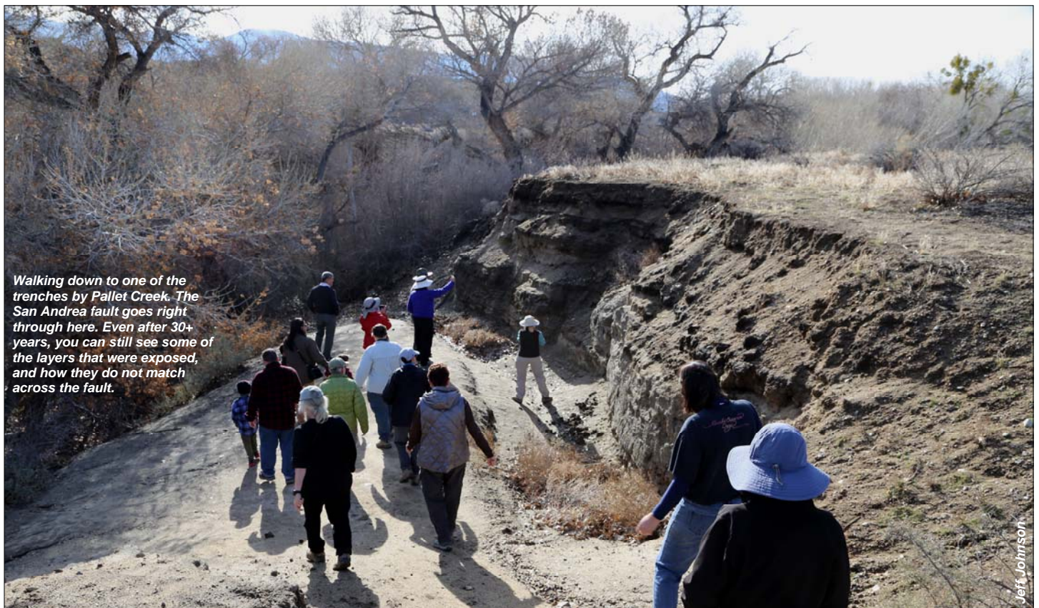
Walking down to one of the trenches by Pallet Creek. The San Andrea fault goes right through here. Even after 30+ years, you can still see some of the layers that were exposed, and how they do not match across the fault.