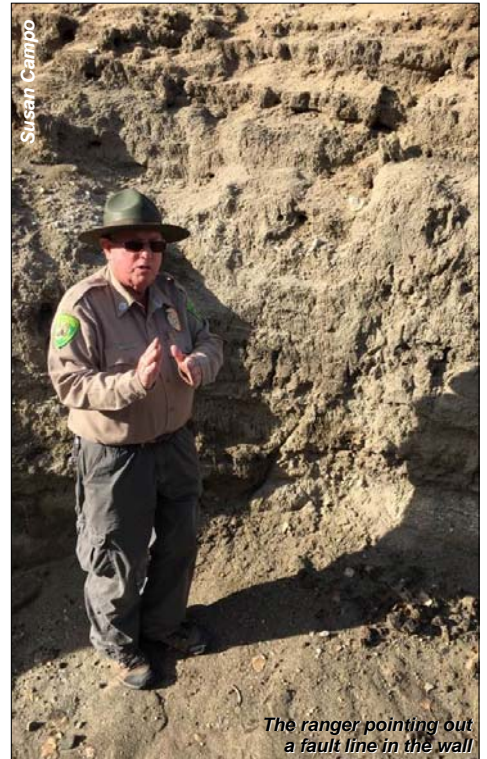
The ranger pointing out a fault line in the wall

those layers allowed Sieh to figure out when those movements occurred, Sieh could state in 1981 in a report of his work there to date ( pubs.usgs.gov/of/1981/0887/report.pdf ) that "9 large earthquakes which occurred between 500 and 1857 A.D. had an average recurrence interval of about 160 years." This was new information to people